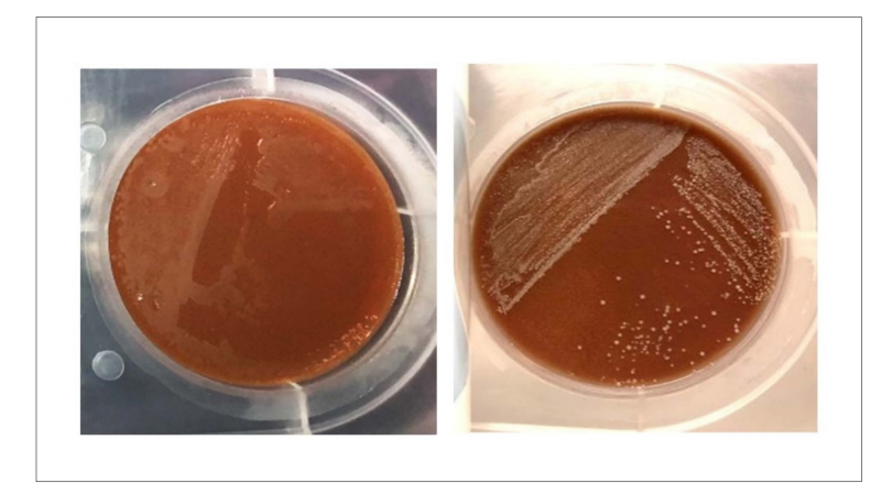
Figure A2. Comparison of subcultures of S. aureus on InTray MH Chocolate agar before ( left ) and after ( right ) optimisation of InTray subculturing protocol.

These small adjustments to the protocol improved the growth of single isolated colonies on InTray cassettes. The Figure below shows growth on InTray before and after protocol optimization. (Figure A2).